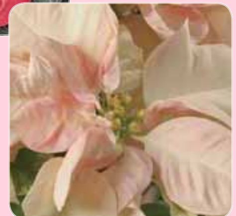
Right Top: Strawberries N' Cream Middle: Winter Rose Right Bottom: Visions of Grandeur Left Top: Red Glitter (NEW) Left Bottom: Jubilee Red (NEW)