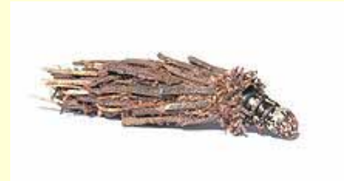
Top Bagworm emerging from its case Bottom Bagworm attached to plant

Here is a link to more information or images: http://landscapeipm.tamu.edu/ornamentals/trees_shrubs/bagworms.html