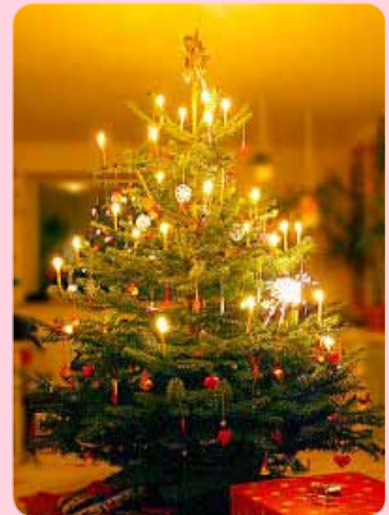
Above: Christmas Tree photo courtesy of Wikipedia.