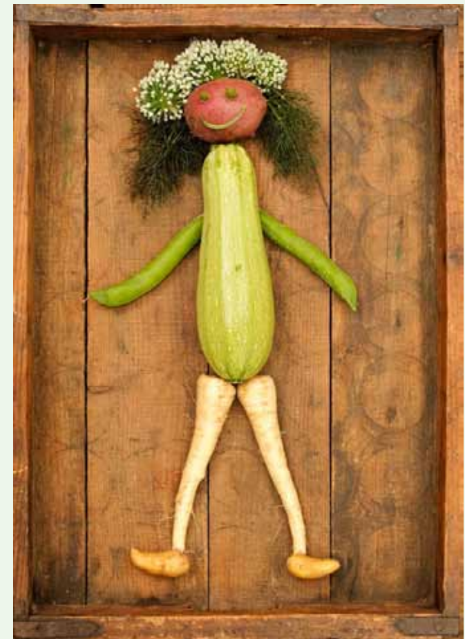
Veggie Woman

There'll be music and joy as I enter the gate, Come in, He will say; do not hesitate. Your kinfolk are here, your dad's in the chair readin', The rest are out back, in the Garden of Eden.