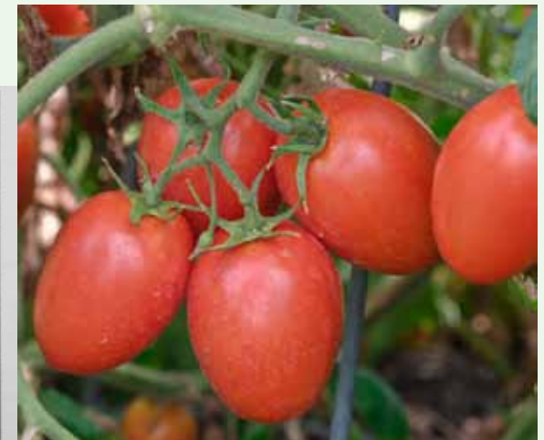
Above: 'Viva Italia' Tomatoes Left: Patty's Vegetable Garden Plan